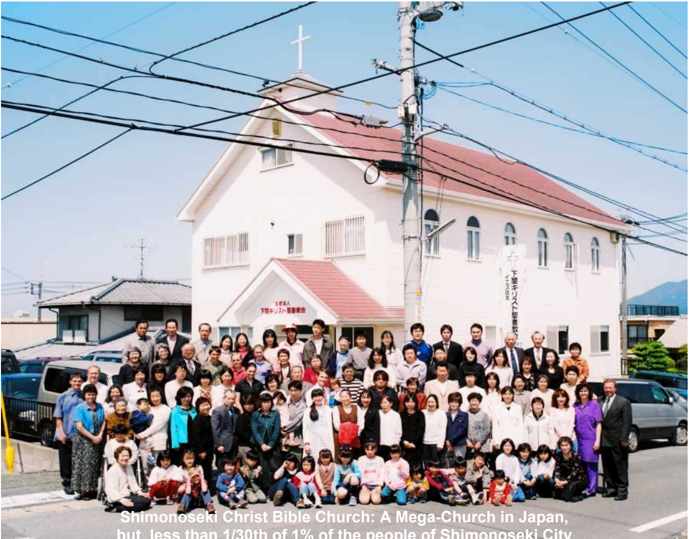
Shimonoseki Christ Bible Church: A Mega-Church in Japan, but less than 1/30th of 1% of the people of Shimonoseki City