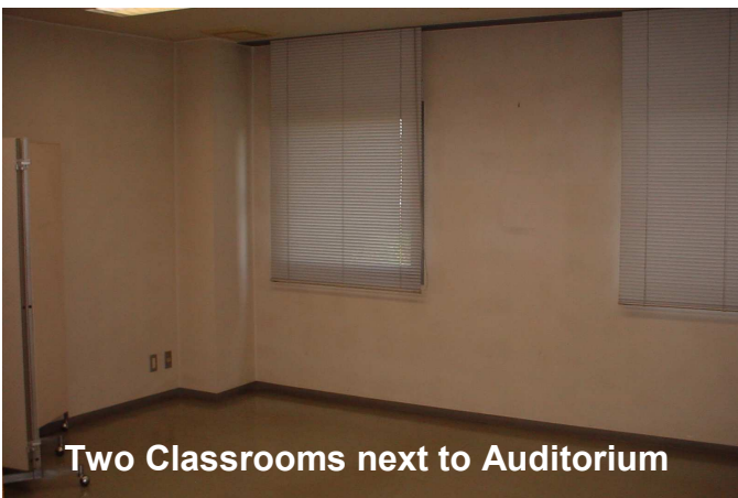
Two Classrooms next to Auditorium

ture. Ninety Japanese believers would need to pay about 1.5 million dollars towards making this dream a reality. It would take each of them giving about $140 a month for the next ten years or $55 a month for the next twenty-five years to this project to be able to pay it off. They have already paid for half of the loan on the church building in the northern part of the city but still have about $167,000 left to pay on it. For the new Christian Center in the southern part of the city that houses the only Christian bookstore for the entire prefecture, they still have $615,000 to pay on that loan. Then, there is the possible eastern campus with an estimated price of $625,000. Would you consider joining hands with these Japanese believers as God leads them to advance throughout the city with the gospel of Jesus Christ?