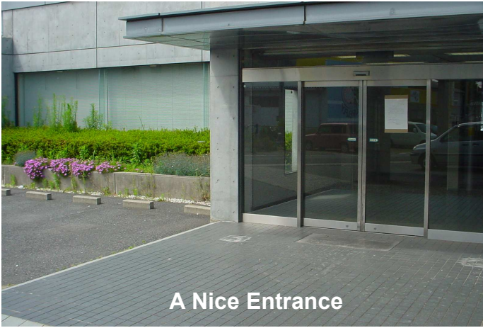
A Nice Entrance