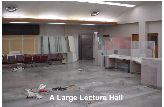
A Large Lecture Hall

ture. Ninety Japanese believers would need to pay about 1.5 million dollars towards making this dream a reality. It would take each of them giving about $140 a month for the next ten years or $55 a month for the next twenty-five years to this project to be able to pay it off. They have already paid for half of the loan on the church building in the northern part of the city but still have about $167,000 left to pay on it. For the new Christian Center in the southern part of the city that houses the only Christian bookstore for the entire prefecture, they still have $615,000 to pay on that loan. Then, there is the possible eastern campus with an estimated price of $625,000. Would you consider joining hands with these Japanese believers as God leads them to advance throughout the city with the gospel of Jesus Christ?