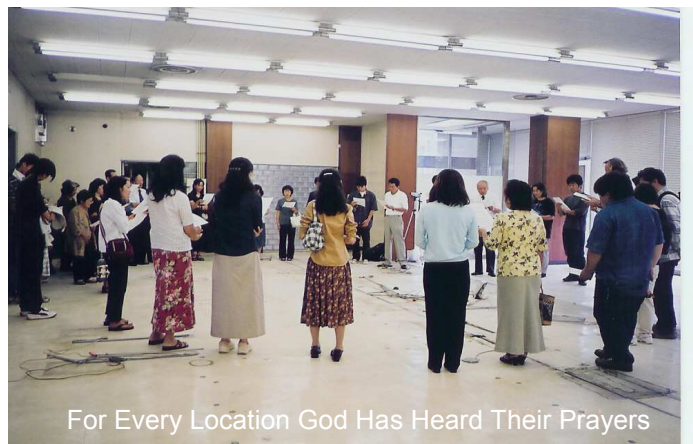
For Every Location God Has Heard Their Prayers