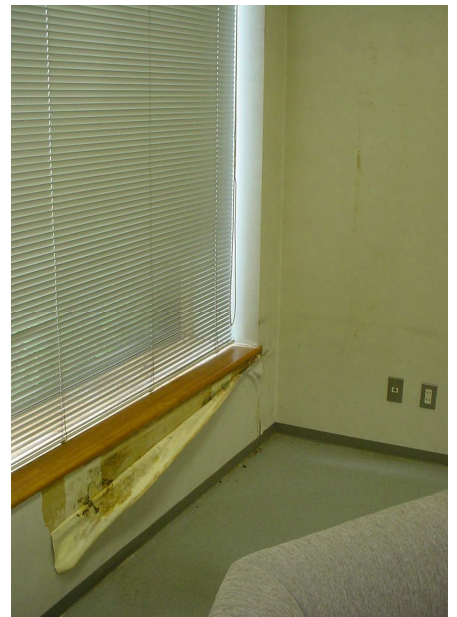
(Though in good condition, this building will also need some repairs and renovation)